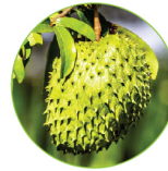
SourSop (Lakshman phal)